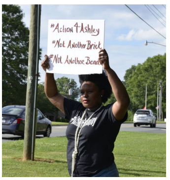
February 2018 - Ashley teachers and advocates attend WSFCS Board of Education meeting to speak out about concerns with building. https://www.journalnow.com/uploaded_photos/ashley-elementary-school-board-copy/image 8399c748-9a59-556a-aa2a-3fef274b69ef.html