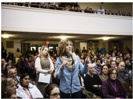
January 2015 - Parent meeting with WSFCS to discuss concerns about environment issues at Hanes and Lowrance Middle Schools. https://www.journalnow.com/gallery/hanes-lowrance-parents-meeting/collection 9f020bb8-a762-11e4-80db-cb052c09b518.html#8